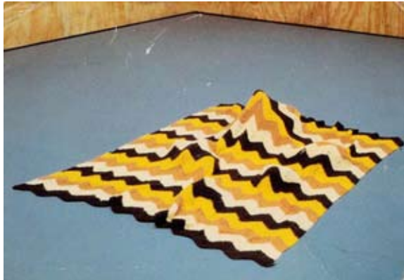
Mike Kelley Arena #4 (Zen Garden), 1990 stuffed animals under afghan, 72 × 52 inches