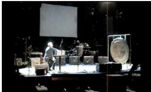
Mike Kelley Untitled (Mike Kelley Throw Potatoes At A Gong), 2009 Performance for A Fantastic World Superimposed On Reality: A Select History Of Experimental Music