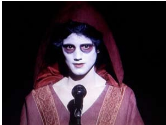
Mike Kelley Day Is Done, 2005-2006 DVD 169 min, color, sound