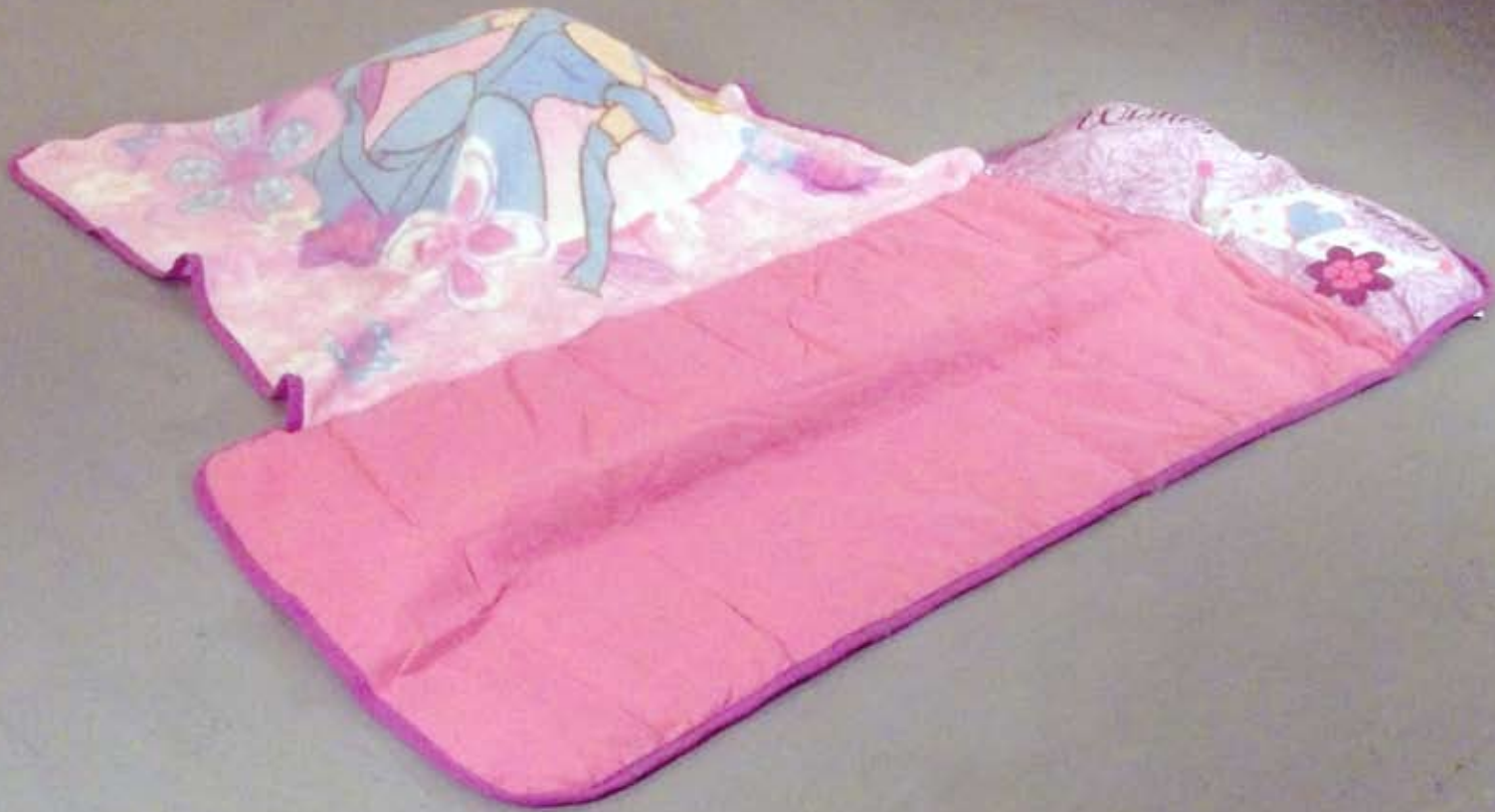
Colleen Asper The Princess, the Pea, and the Rod, 2013 objects under blanket, 42 x 42 x 8 inches