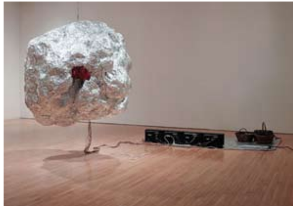
Mike Kelley Silver Ball, 1994

aluminum foil, polyurethane foam, wood, chicken wire, speakers, four boomboxes, three baskets, and artificial fruit, ball 60 inches diameter , blanket 84 x 60 inches