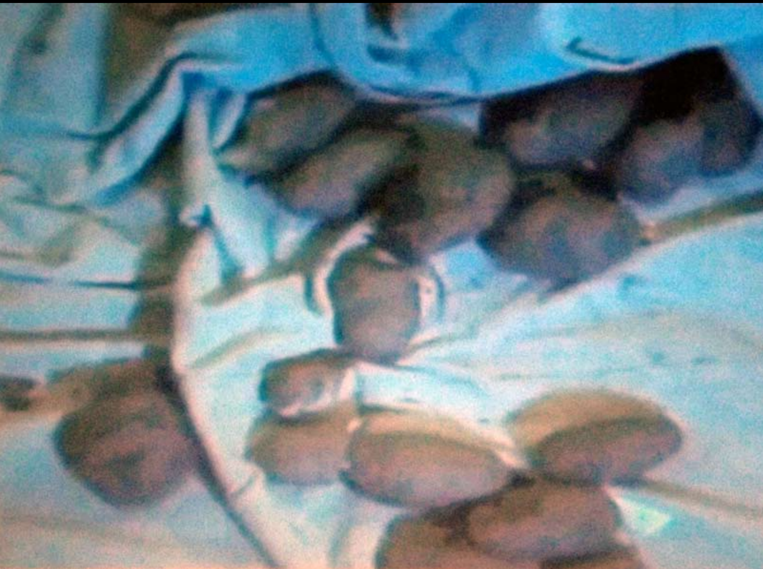
Devon Dunhill Clapp Paranoid of Blondes, 2013 DVD 2 mins, color, sound