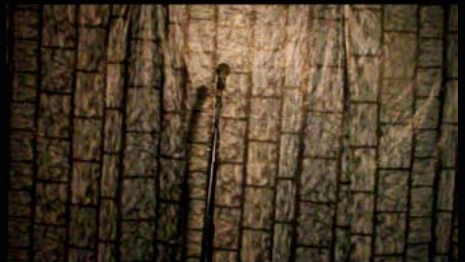
Kate Ferencz Day Is Done (The Shy Satanist), 2013 DVD 1 min, color, sound