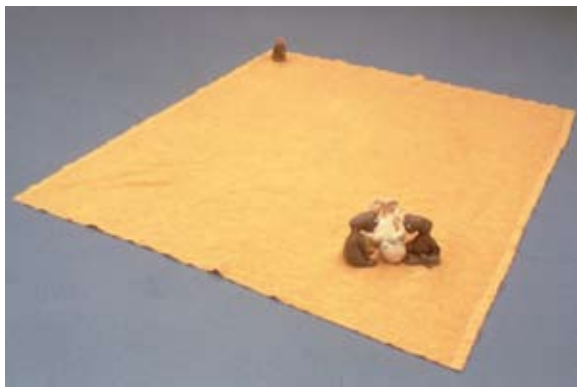
Mike Kelley Arena #5 (E.T's), 1990 stuffed animals on blanket, 7 x 97 x 87 inches