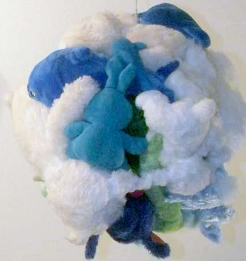
Lindsey Dickson + Justin Samson Deodorized Central Mass with Satellite, 2013 acrylic paint, cardboard, hot glue, styrofoam, stuffed animals, air freshener ball 18 inches diameter, deodorizer 20 x 55 inches