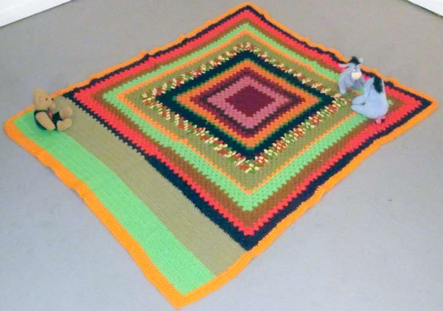
Justin Samson Arena # ?, 2013 stuffed animals on blanket, 44 x 60 x 8 inches